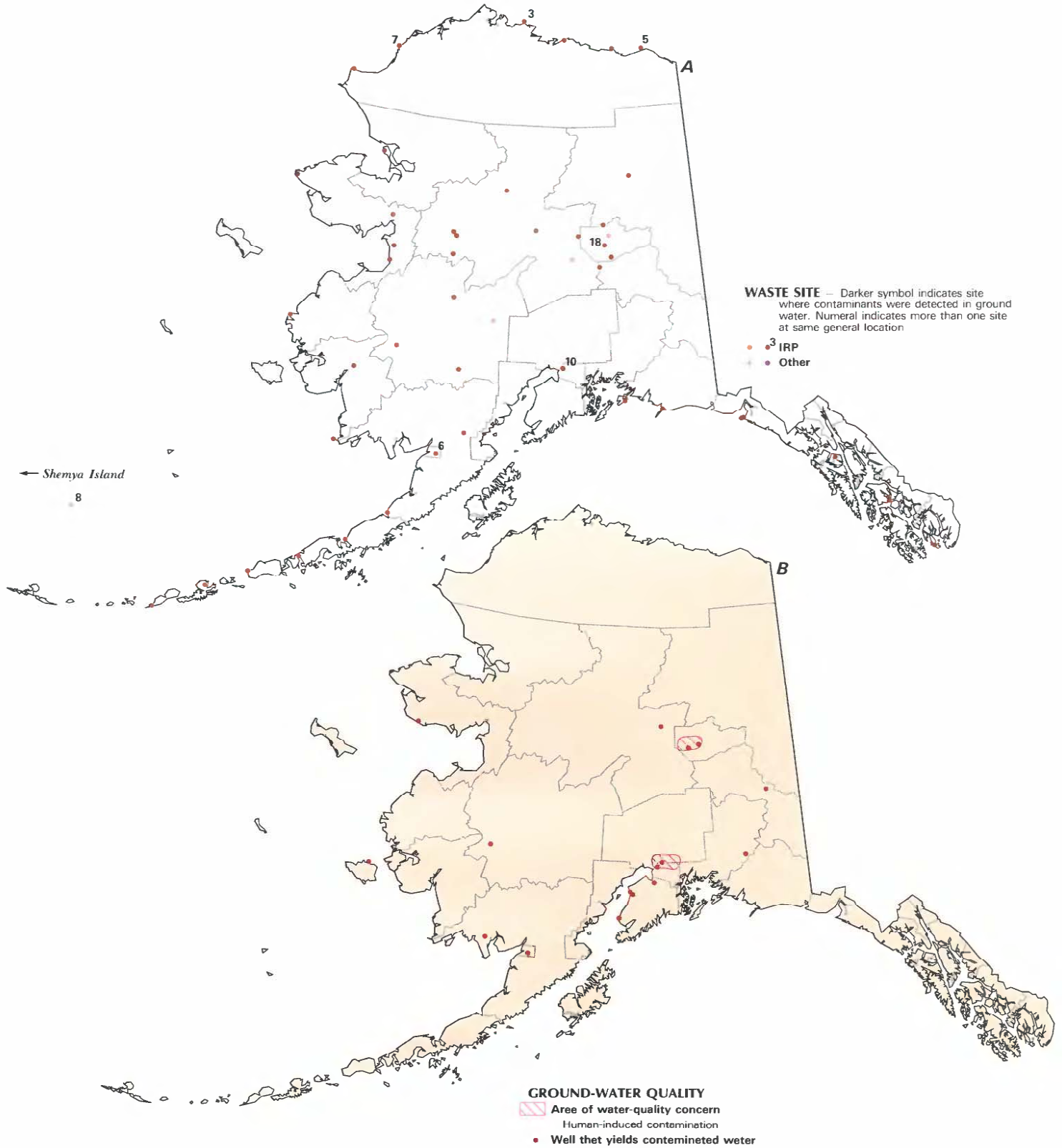
Figure 3. Selected waste sites and ground-water-quality information in Alaska. A , Department of Defense Installation Restoration Program (IRP) sites, as of 1985. B , Areas of human-induced contamination and distribution of wells that yield contaminated water, as of 1986. C , Municipal landfills, as of 1986. (Sources: A , U.S. Department of Defense, 1986. B , Alaska Department of Environmental Conservation files, 1986. C , Henry Friedman, Alaska Department of Environmental Conservation, oral commun., July 1986.)