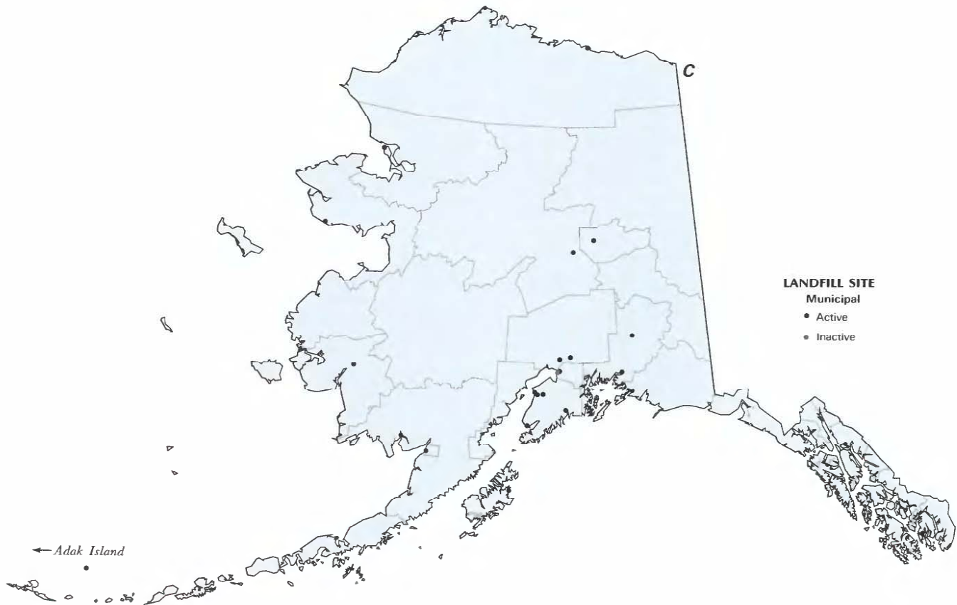
Figure 3. Selected waste sites and ground-water-quality information in Alaska—Continued.

The summary (fig. 2B) shows the variability in chemical quality of the water from unconsolidated aquifers for the major areas of water withdrawal. For many areas of the State, the number of wells having water-quality information is too small to be adequate for statistical inference. For these areas, a general indication of the range in dissolved-solids concentrations in shallow unconsolidated aquifers can be gained from an analysis of stream water-quality data for low-flow (or base-flow) periods. During winter in interior Alaska, the ground is frozen, no surface runoff occurs, and any streamflow is sustained by ground-water discharge.