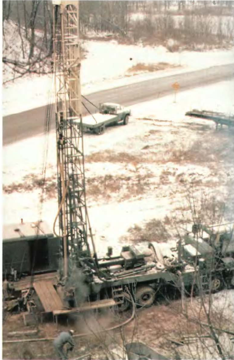
Drilling a deep test well in southwestern Wisconsin. This well was used to measure hydraulic head and water quality differences between individual units of the sandstone aquifer.